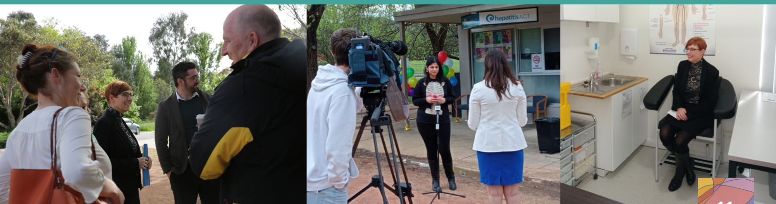
Point-Of-Care Testing Launch

The launch garnered significant media attention, with coverage from Win News, RiotACT, and FM104.7.